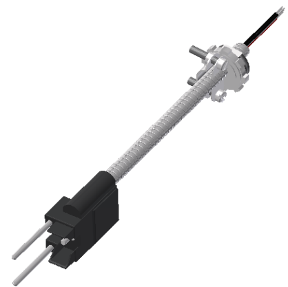
IVOS (Item 2)